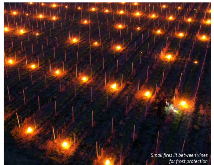
Small fires lit between vines for frost protection